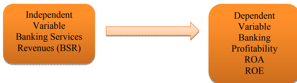
Figure (1) Research Variables

Research sample is Jordan Islamic Bank (JIB) for the period 2001 to 2016. So, the data was taken from Jordan Islamic Bank annual reports for that period. The independent variable is banking services revenues, and the dependent variable is banking profitability which is measured by return on assets and return on equity.